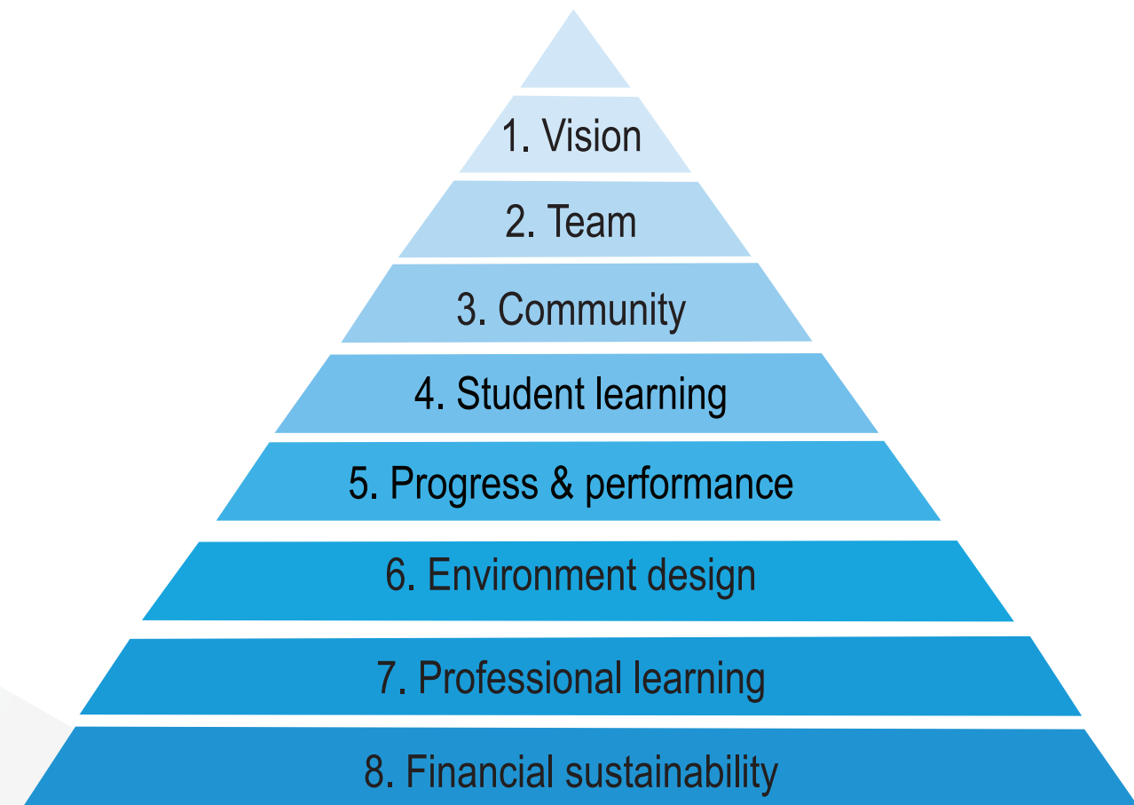
Eight Elements for Success

Click here for more information and workshop schedule.